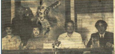
Bob Dylan, second from right, listens to a question at his Press conference.

Bank Holiday records. From tomorrow sailings will start at 20 minutes past midnight and continue at least every hour between Portsmouth and Ryde.