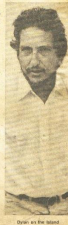
Dylan on the island