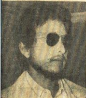
DYLAN... only one concert?